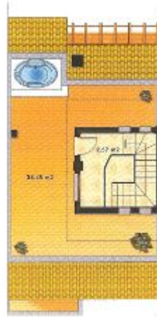
Second floor Enclosed area 13.56 m 2 Solarium 38.45 m 2

TOTAL AREA= 269.88 m 2 1m 2 =10.764 ft 2