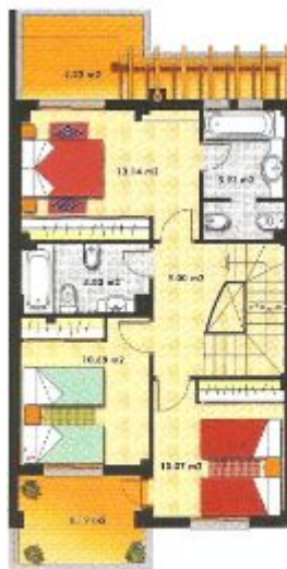
First floor Enclosed area 62.60 m 2 Terraces 15.41 m 2