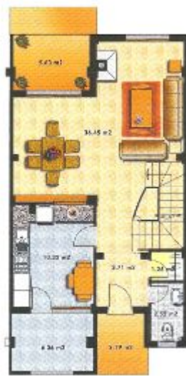
Ground floor Enclosed area 64.53 m 2 Terraces 9.58 m 2