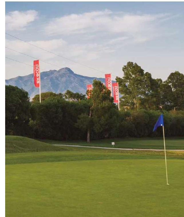
Atalaya Golf & Country Club

And almost on the golf course, separated only by a local road within the development, the spectacular view of the ATALAYA OLD COURSE , 18 holes par 72, created in 1968 and surrounded by high eucalyptus and palm trees, and white and pink azaleas which imbue the atmosphere with their unmistakable aroma. The Atalaya New Course , par 71, also offers amazing views over the Mediterranean and Gibraltar and is considered one of the most natural and most in harmony with its environment on the Costa del Sol. The ENJOY GOLF ACADEMY completes the facilities with 20 covered tees on which to practice and the clubhouse with its restaurant and terrace.