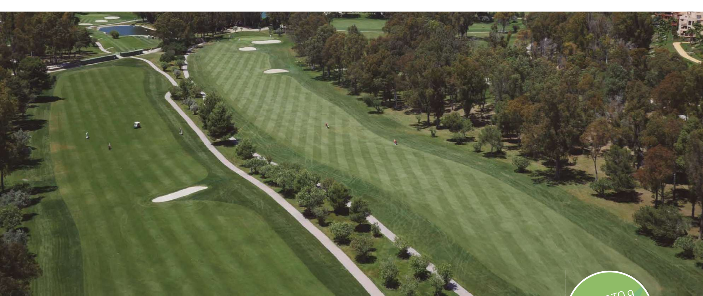
Atalaya Golf & Country Club